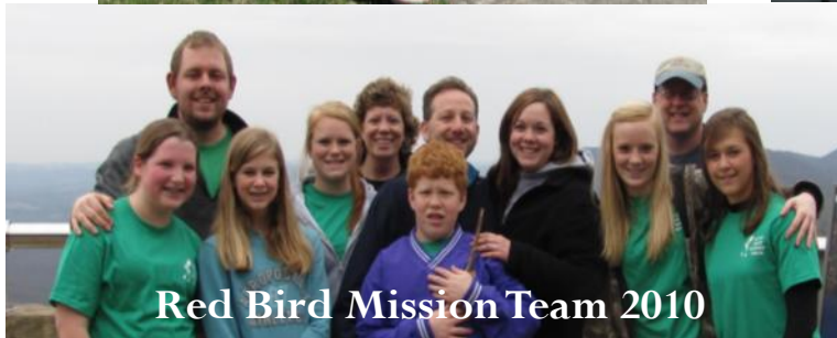
Red Bird Mission Team 2010